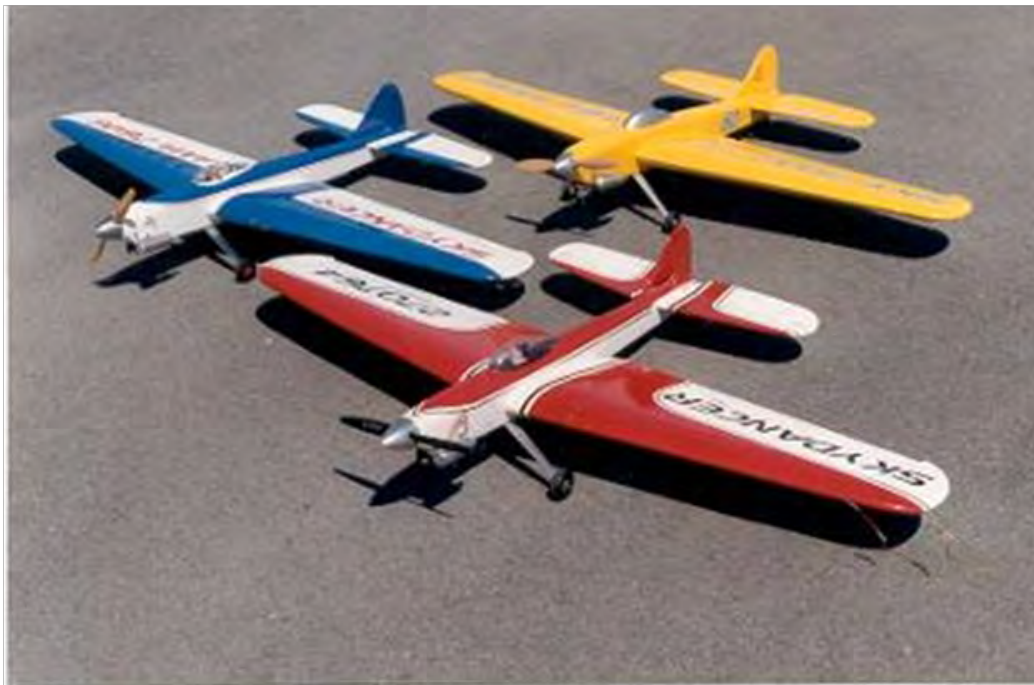
Larry Draughn - Blue and White