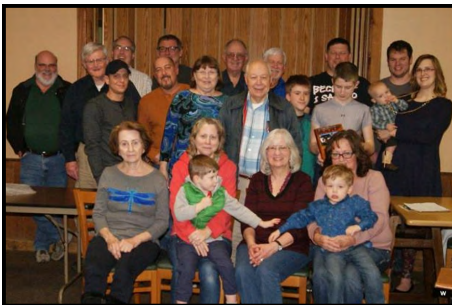
The Carolina Gang