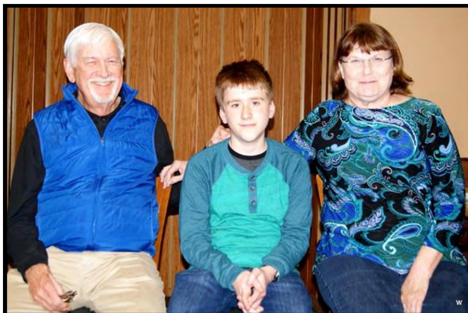
The Powell Family