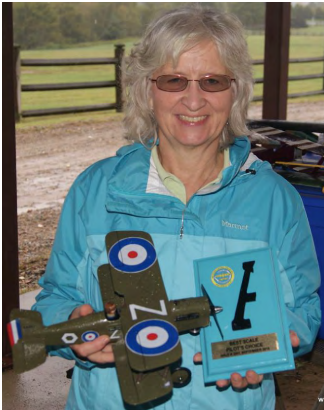
Jo's "Best Scale" Biplane