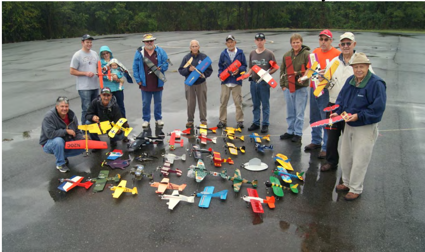
The 1/2A Weather Beaters