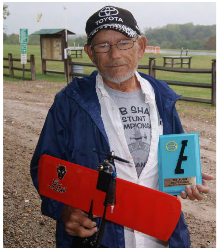
Rusty's "Best Flight" Li'l Satan